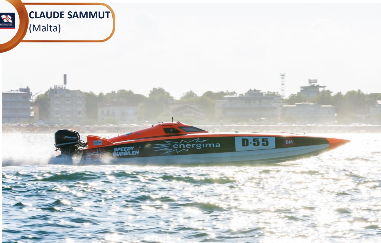
UIM European Championship – Offshore Class 3D – Grand Prix of Italy, Cervia, 2 September 2022