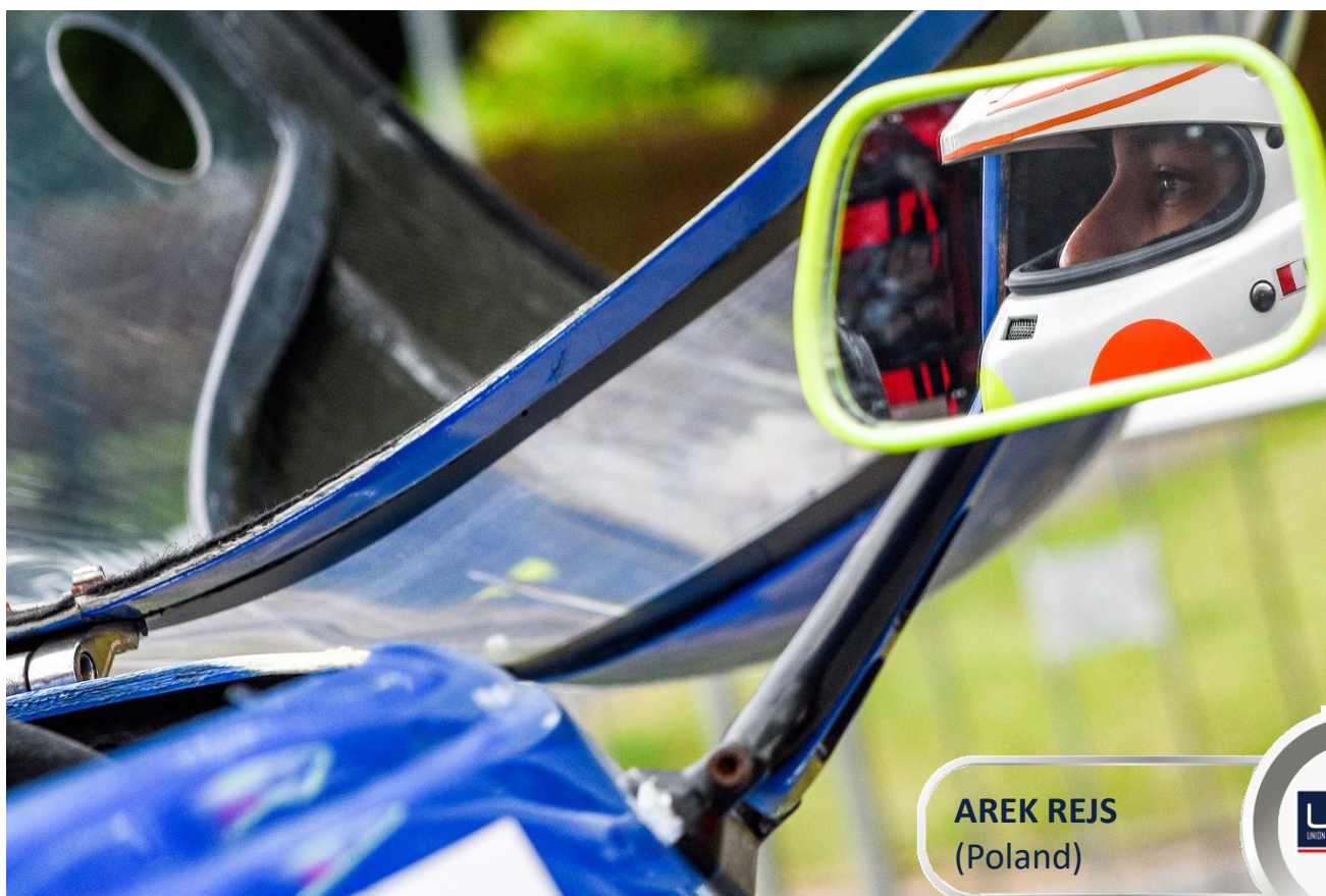
AREK REJS (Poland)