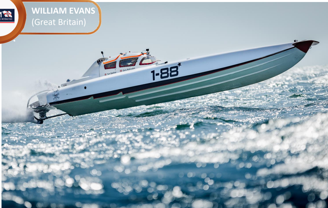
2022 UKOPRA Offshore Championship – Class 1 – Hamble, Southampton, Great Britain, 17 July 2022