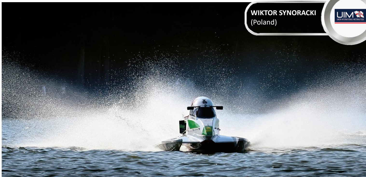
UIM World Championship – F500 – Grand Prix of Poland, Jedownice, 13-15 May 2022