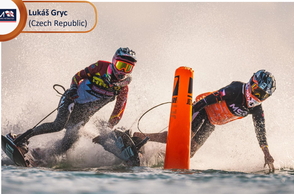
UIM MotoSurf World Championship – Men Class – Grand Prix of Italy, Rodi Garganico, 9-11 September 2022