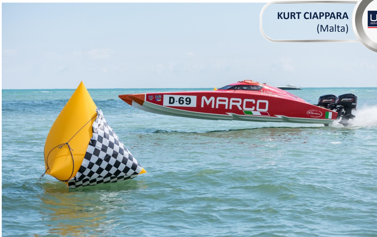
UIM European Championship – Offshore Class 3D – Grand Prix of Italy, Cervia, 2 September 2022