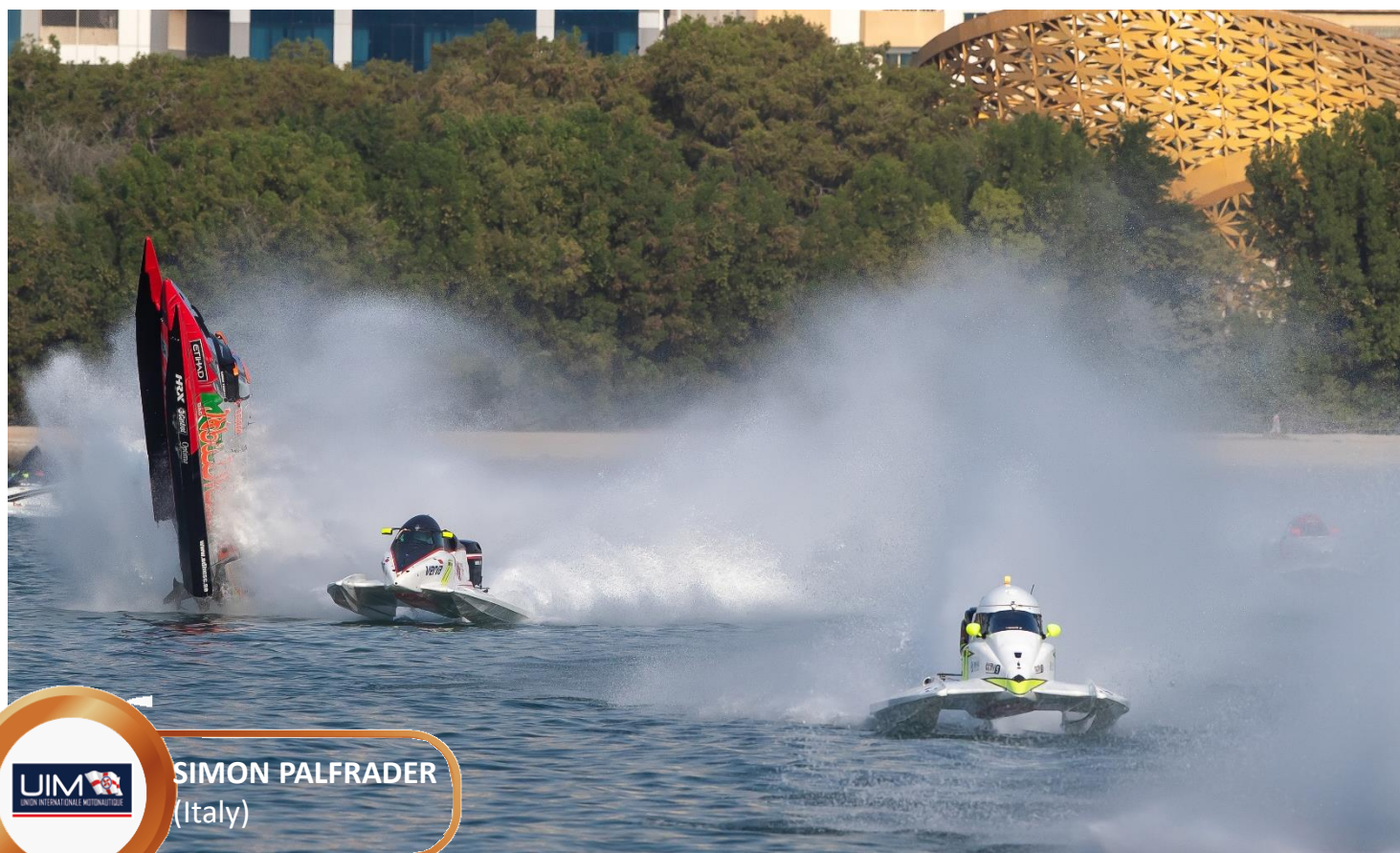
UIM F1H2O World Championship – Grand Prix of the UAE, Sharjah, 15-16 December 2022