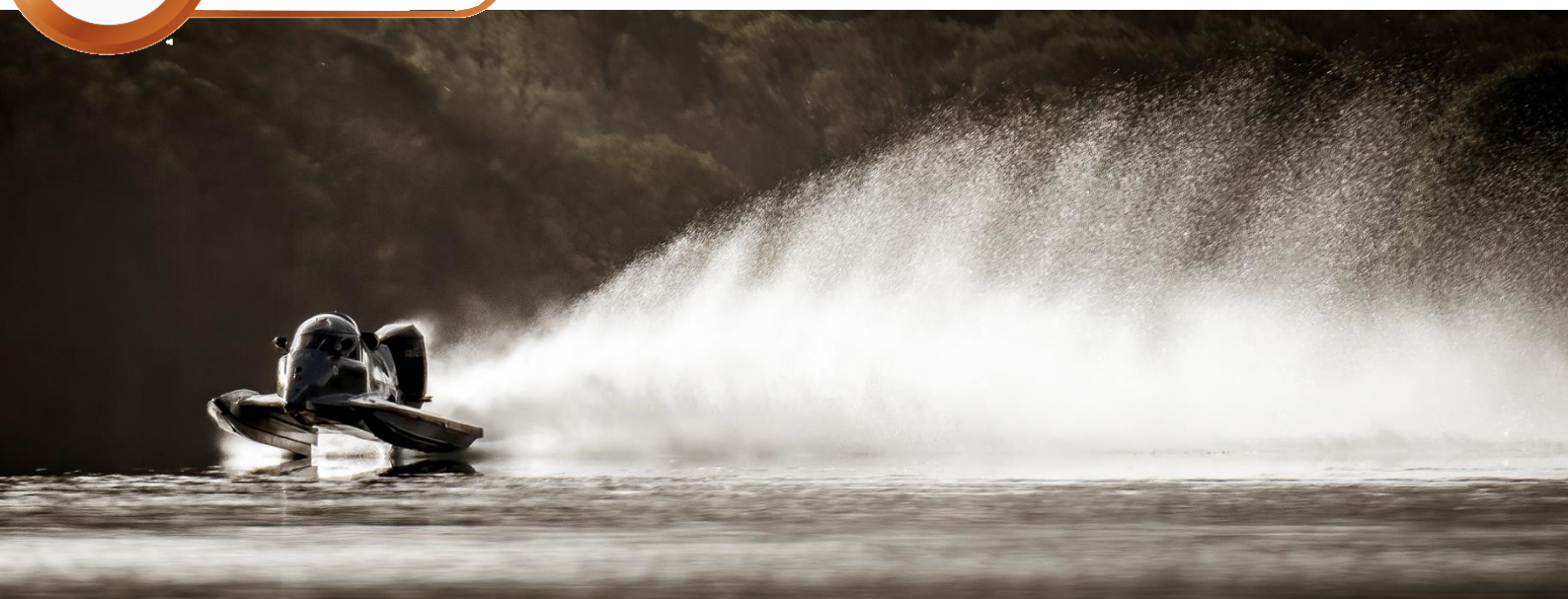
ROB CLIFFORD (Great Britain)

50th Edition of the Coniston Powerboat Record Week – Formula 2 – Coniston Water, Great Britain, 31st October-4th November 2022