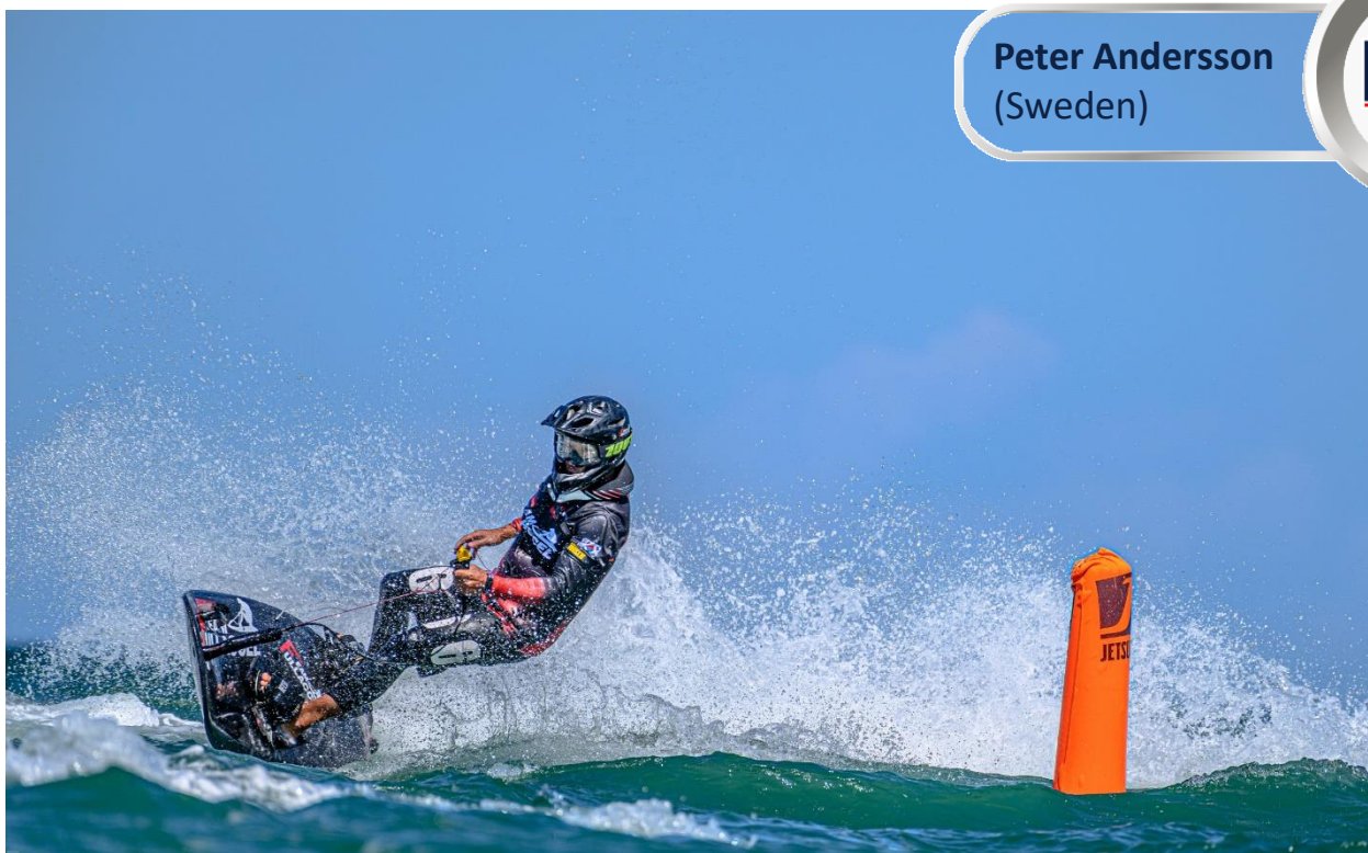
UIM MotoSurf World Championship – Open Class – Grand Prix of Italy, Rodi Garganico, 9-11 September 2022