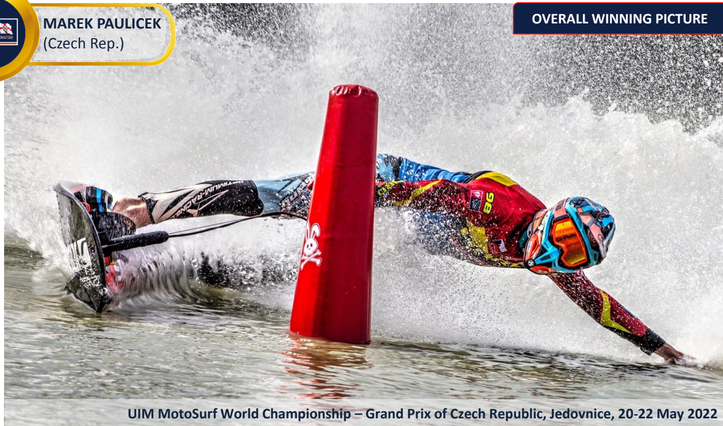
UIM MotoSurf World Championship – Grand Prix of Czech Republic, Jedovnice, 20-22 May 2022

We are very pleased that the number of submissions for the 2022 UIM Photo Contest has continued growing compared to the numbers of last year and the year before. 18 Photographers have submitted 190 images altogether for consideration in the different categories. This is still short of pre-pandemic figures and we would be delighted to see a further increase next year.